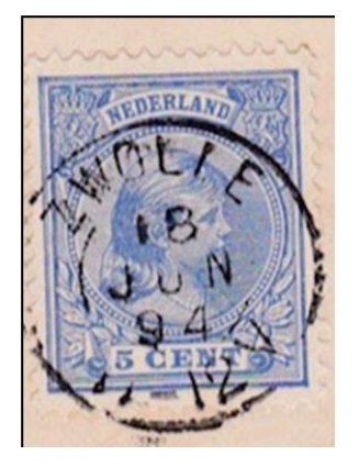
Figure 4 Zwolle Smallround

stamps had to be attached to the top left corner this was hardly ever enforced. Receipts as the ones shown here did not even have room for stamps on the top left corner.