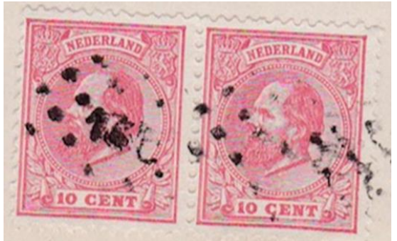
Figure 2. Zwolle "135" numeral cancel.

The stamps in this case are not used to pay for postage, but as a fee to the PTT for collecting the money due. The postal law of 1870 stipulated that for the service of collecting invoices ( kwitantien in Dutch) the fee would be 10 cents for every fl. 10 collected. It also mentions that the stamps paying for this service had to be canceled with a numeral cancel. This then explains the 20 cent fee (the invoice was for fl. 15.25) and also the "135" Zwolle numeral cancel on the 1884 invoice ( Figure 2 .)