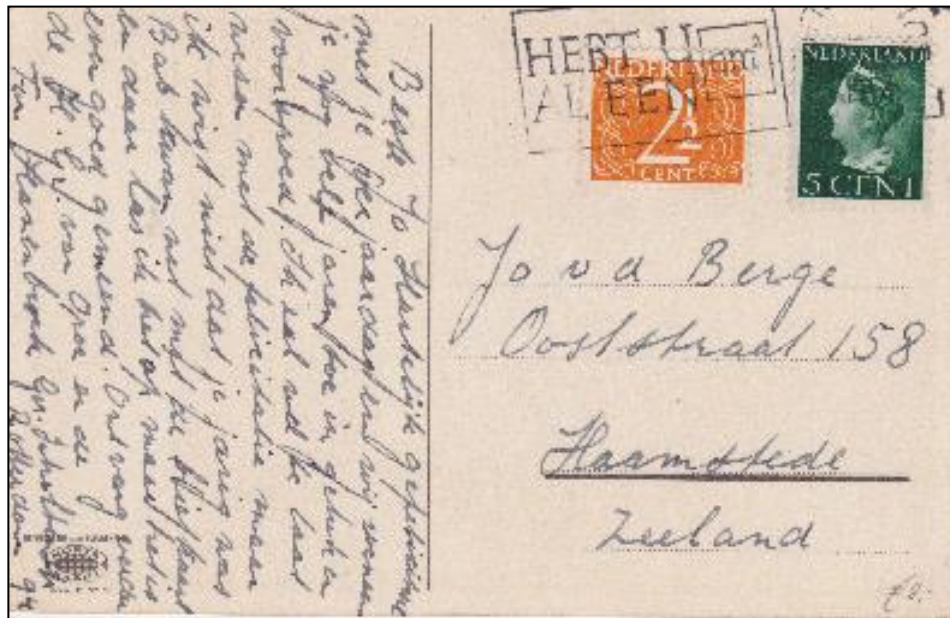
A 1948 postcard franked with a supplementary 2½ cent van Krimpen issue to fulfill the 7½ cent postcard (briefkaart) rate.

Here come the collectors of advertising cancels into the picture. It turns out that these types of cancels often didn't show up very well on the blue background of the 2 cent stamp, but much better on the 2½ cent orange version. The collectors figured that it would be worth it to spend the extra half cent.