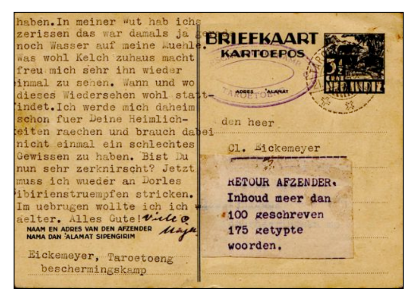
Fig. 2 A second postal card sent the same day by the same person

Fairly early after the protection camps (there were six of these, four on Java, two on Sumatra) were opened plans were made to return the women and children to Germany. The first group left from