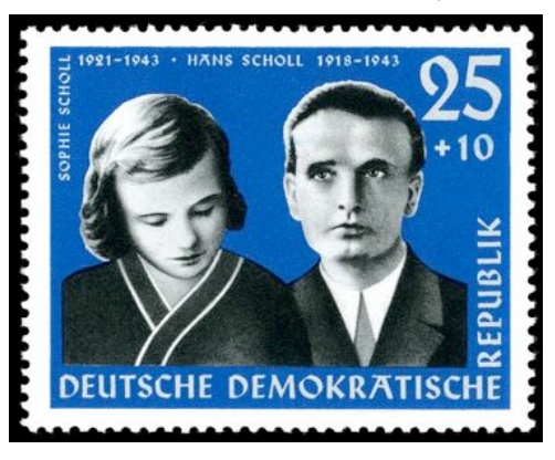
Fig. 3 Hans and Sophie Scholl, E.Germany 1961

Both Hans and Sophie admitted their full responsibility in an attempt to end any form of interrogation that might result in them revealing other members of the movement. However, the Gestapo refused to believe that only two people were involved and after further interrogation, they gained the names of all those involved who were subsequently arrested.