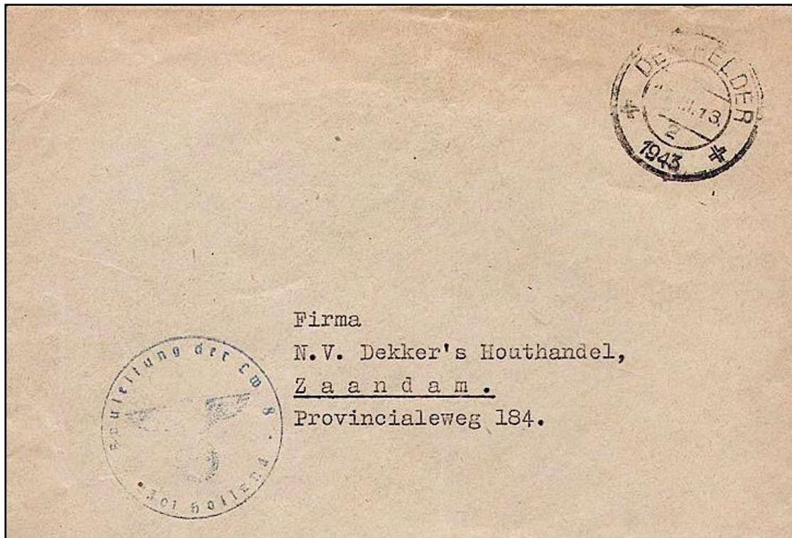
1943 cover sent by the Bauleitung der L. W.

This cover was sent March 11, 1943 from Den Helder to Zaandam. It has no postage on it so it must have qualified for free franking. But why?