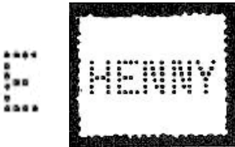
The Zutphen HENNY perfin

How can you distinguish between the two? First of course you would look at the cancel on the stamp. If you are lucky it could say Zutphen or ‘s-Gravenhage (the Hague) and you would be done. If there is no clear defining cancel you have to take a closer look at the perfins, especially at the letter “E”. If you look at the top horizontal part of the E you’ll notice that for the The Hague perfin, the third hole from the left is a bit lower than the other three holes.