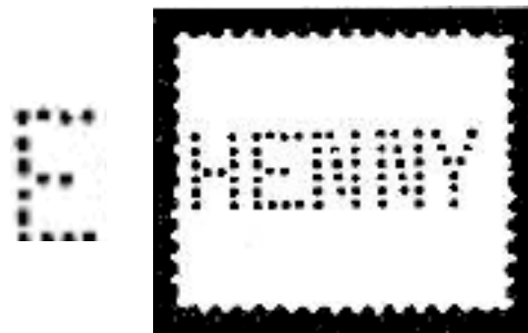
The Hague HENNY perfin

If you take a close look at the perforated HENNY stamp at the beginning and the image to the right you will notice the ‘damaged’ H and E.