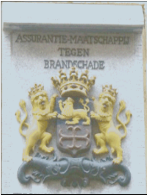
Assurantie-Maatschappij tegen Brantschade Coat of Arms.